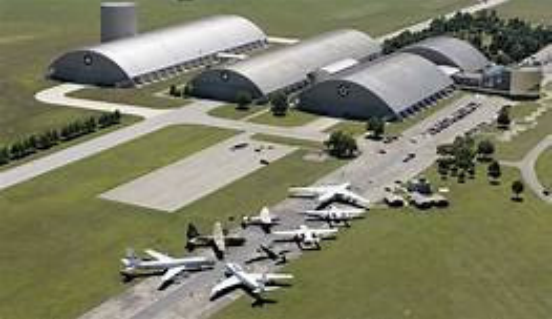
National Air Force Museum-Dayton, OH